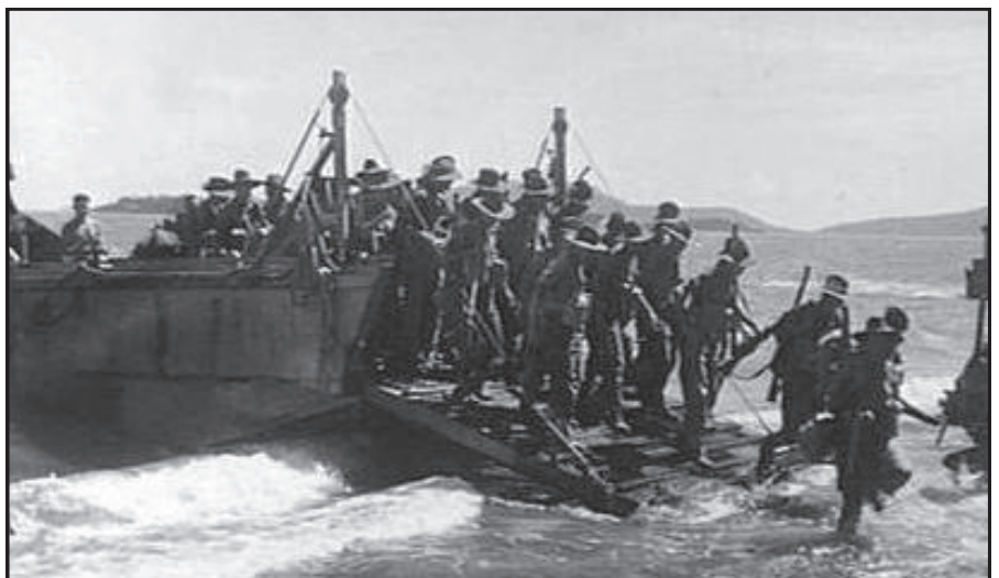
Bougainville. 1945-05-25. Troops of 31/51 Infantry Battalion coming ashore from barges onto the beach in the North Bougainville area where they will go into action under 11 Infantry Brigade. AWM092563

Article source: An extract from http://www.awm.gov.au/units/unit_11316.asp