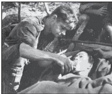
New Guinea, 1942. An Australian soldier gives a Japanese prisoner a drink of water.

Another thing I can remember so vividly, when a thirsty "prisoner" would approach a guard, snap to attention, bow, and say in broken English "Watta Masta" ”